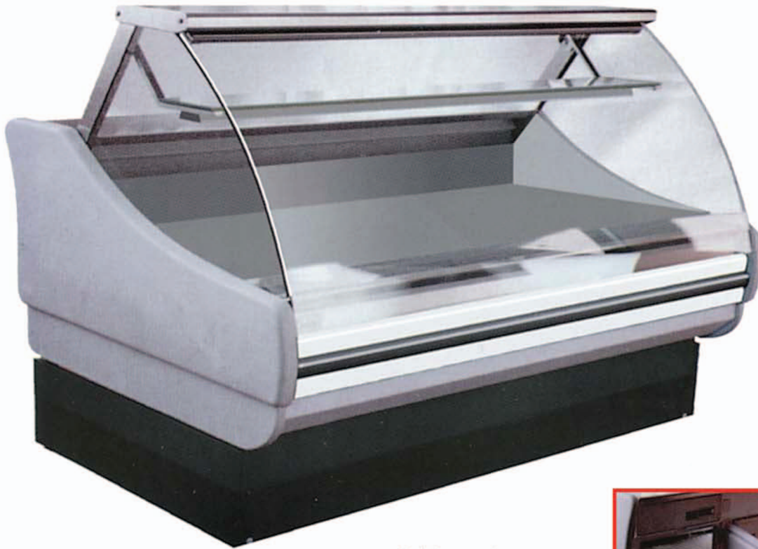
Refrigerated rear storage.